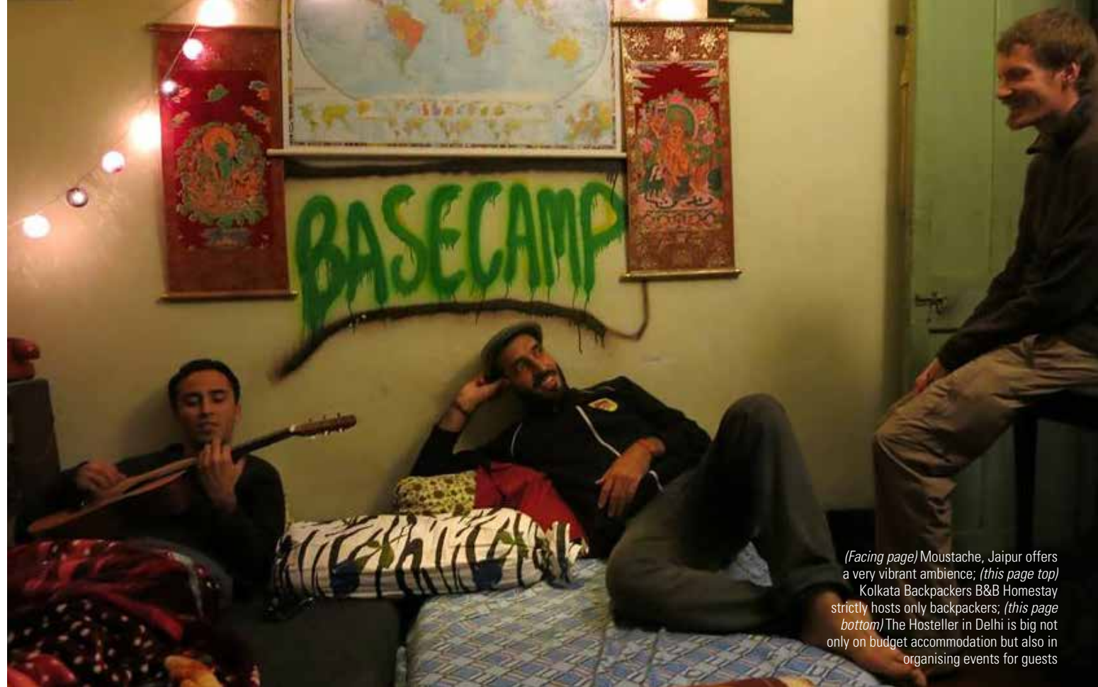
(Facing page) Moustache, Jaipur offers a very vibrant ambience; (this page top) Kolkata Backpackers B&B Homestay strictly hosts only backpackers; (this page bottom) The Hosteller in Delhi is big not only on budget accommodation but also in organising events for guests

USP Travel anywhere in India and there's a good chance you'll find a YHA! hostel there. Tariff Varies according to the place and hostel. Contact www.yhaindia.org